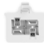
Ceiling Mount Base (15/16" T-Rail)