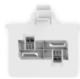
Ceiling Mount Base (9/16" T-Rail)