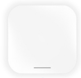
Indoor Access Point