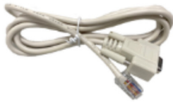
RJ-45 Console Cable