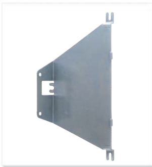
Panel Mounting Bracket KSD-8PB